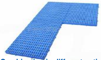
Combination in different options

*Suitable for various kinds of forklifts and in production lines and storage shelf, easy handling.