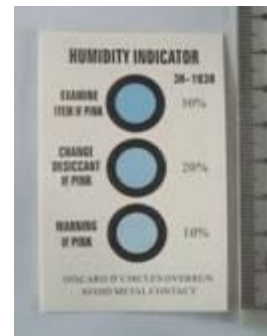
50*76mm (Click to enlarge it)