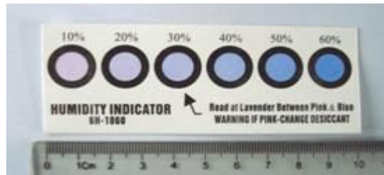
102*38mm (Click to enlarge it)