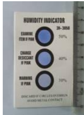
50*76mm (Click to enlarge it)