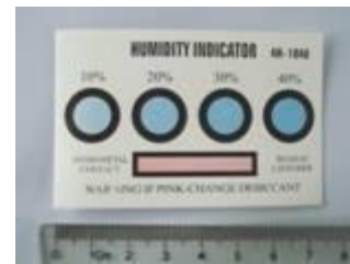
50*76mm (Click to enlarge it)