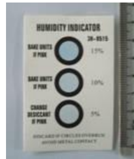
50*76mm (Click to enlarge it)