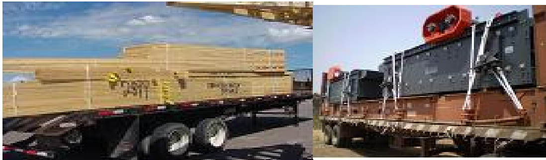
Buckles matching to different belts