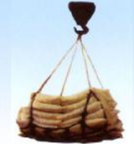
4-branch, defence ring

Lifting ropes are widely used in different fields like petrol, chemical, no fire area, machine process, machine assemble and outer surface paint container lifting. Rope length is decided by users from 0.5T to 150T. With light weight, efficient, anti-abrade and non-sparkle collision, it's used in power plant for overhauling and hoisting of generator and steamer rotor, etc. It is an ideal substitute product of steel wire rope.