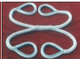
4-branch, defence ring