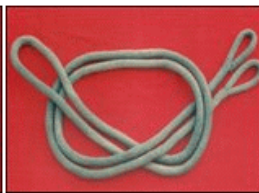
Eye & Eye