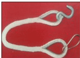
Nylon rope, with hook