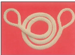
2 ends buckle