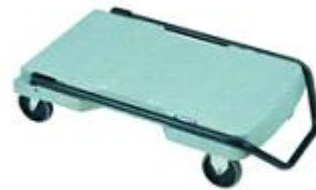
Foldable Hand bar