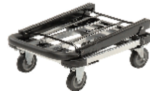
PH153 Aluminum type, foldable, lightweight