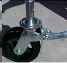
Strong Stable Caster