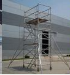
JPW Series Steel