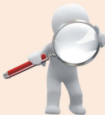
Still Search Everywhere?